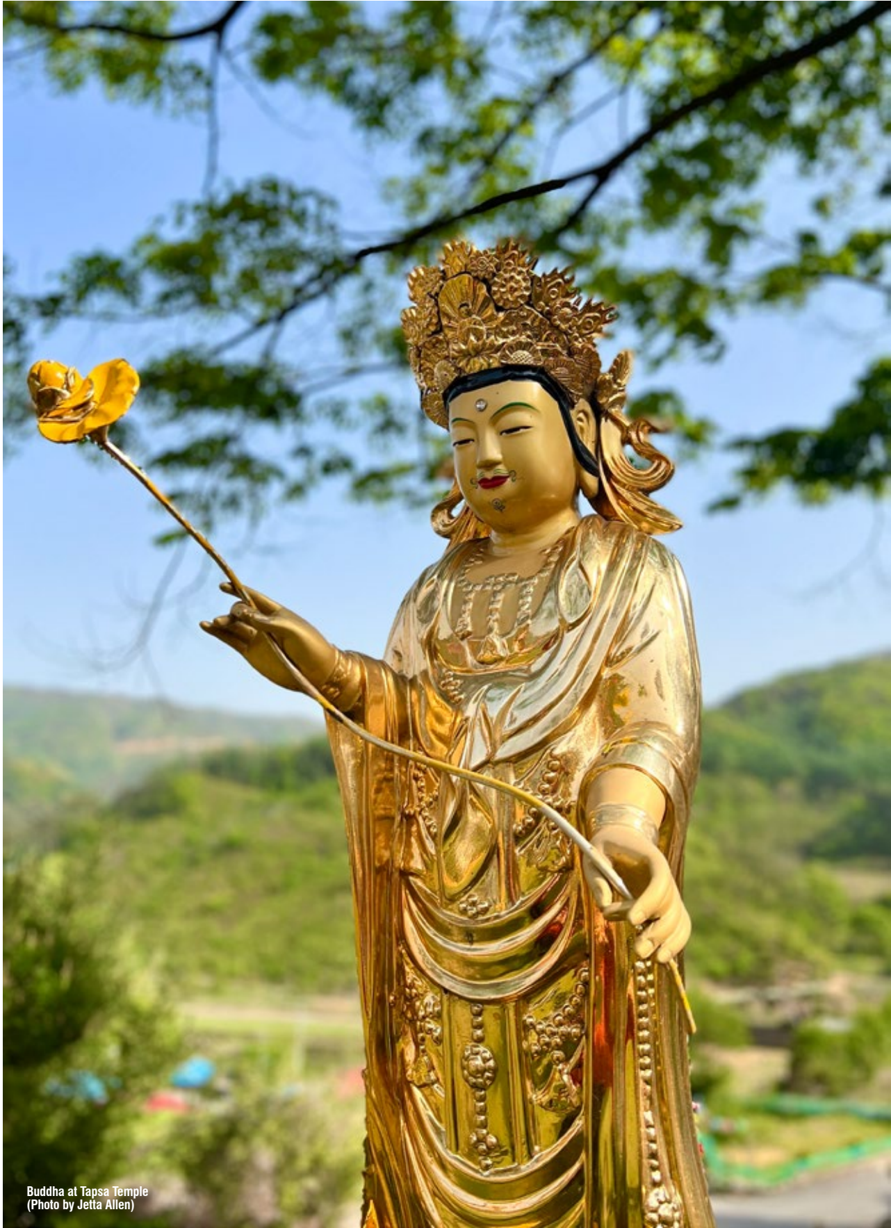
Buddha at Tapsa Temple